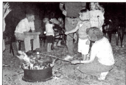
Evening Camp Fire