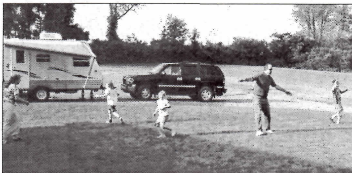
Afternoon Game Time