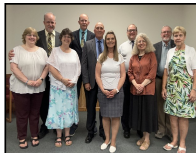
Our CPA Mission Family

We had a great CPA Missionary Pastors' Retreat in June. Thanks to so many of you this week was a blessed time for all of us. We were refreshed and renewed as we met together each day. We are grateful for each one of you that made this a wonderful week!