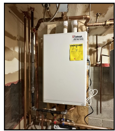
Our New Boiler

I have always said, “God will supply everything for His work. It is a blessing to see God work all around us. What we need to do is look around and get involved in His work.”