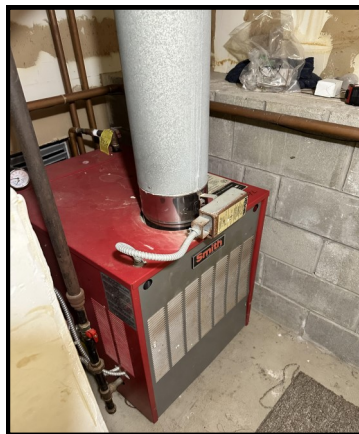
Our Old Boiler

After several problems with our 30+ year old boiler, we felt it was time to replace our inefficient boiler once and for all. We researched and began to raise funds for a new boiler. A couple in the church offered $2500.00 if the church would match those funds. After just 3 weeks we had $5000.00. Praise the Lord! We knew it would cost more than that, so we continued to raise money for this project. Slowly, we were getting to the amount needed. Then one of our supporting churches, Erieside Church on the Boulevard, in Willowick, Ohio, sent us $2,000.00 for this need. That made the difference. We were able to hire Fallbrook Heating and Cooling to install our new high efficiency boiler. This project is now complete and we look forward to an uninterrupted heating season with some savings. Thank you to all who generously gave toward this project. The Lord is definitely good!