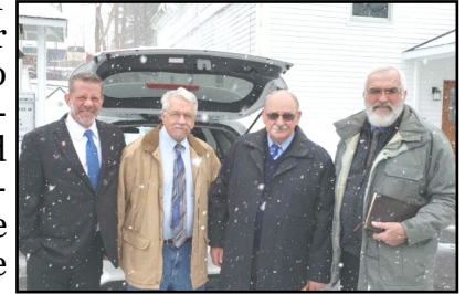
Grace Mission to the World Exploratory Team

We are thrilled with anticipation for new renovations coming this summer and fall. We have been working to make the outside of our church building beautiful for our community and we will do some inside repairs and improvements as well. This fall we are planning to have Grace Mission to The World send a team to help us finish the outside renovations which have been ongoing for a little while. Because of the COVID 19 virus, they had to postpone their mission trip to help us. But as our nation opens up more and more it looks good for September for this work to be done.