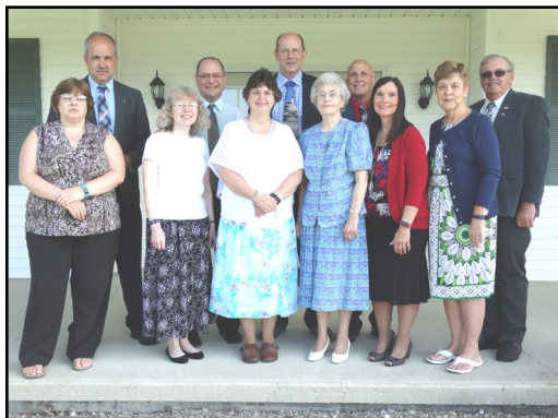
C.P.A. Mission Family

You may have a part in helping the retreat be a blessing to everyone involved. Your gift pays for fuel to travel to the retreat, food that will be enjoyed and housing for all. It has been such a blessing over the years. We have a pink response sheet enclosed in this issue of the BEACON. You can use the response sheet to send your tax deductible gift for this wonderful week. Thank you for your love and support.