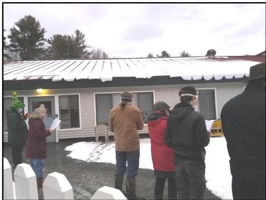
Christmas Caroling Outside Nursing Home