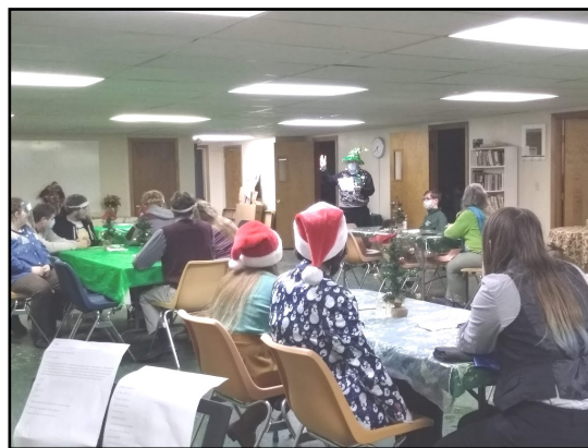
Fellowship after Caroling

When thinking about recent ministry happenings at Emmanuel Baptist Church, we have been focused on building or establishing relationships with some individuals who certainly have limited possibilities for interactions with the current state of things. Take for example, back in December, we as a congregation went Christmas Caroling outside Tall Pines Nursing Home (where we used to come and hold services periodically). The Caroling al-