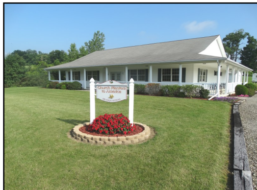
Church Planters to America Headquarters

Each member of C.P.A. is planning to come to headquarters the week of July 19-23 for a time of rest and relaxation. The fellowship we experience that week and the good Bible teaching and preaching benefits each and encourages to keep on keeping on.