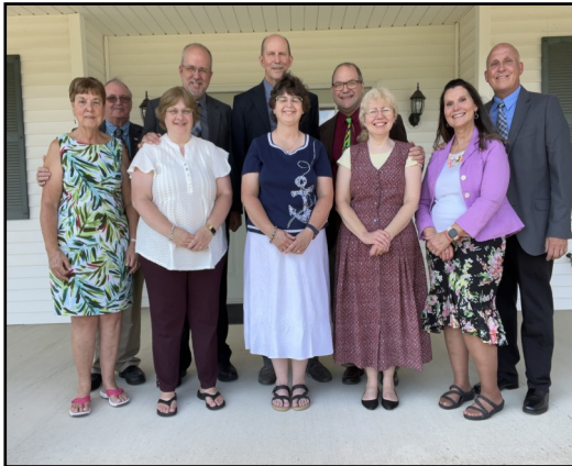
C.P.A. Mission Family

It was decided last summer at our Annual Missionary Pastors' Retreat to make our retreat a little earlier in the summer. This is a big help as summer activities can be better planned for in July and August. Each year we send out a flyer and a response sheet to invite you to make this retreat fully paid for our missionaries and board members. This is the only financial plea that we make each year. God has been good to provide funds so our team can come and enjoy the week without any added expense to them. It is you that make this possible. Enclosed in this BEACON is our response form for you to fill out if you wish to help with our retreat.