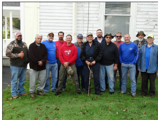
Photo: Group from September 2021, Grace Mission to The World work team

Please pray for all the details to come together in September and that a good team will form to come and encourage us as they did two years ago.