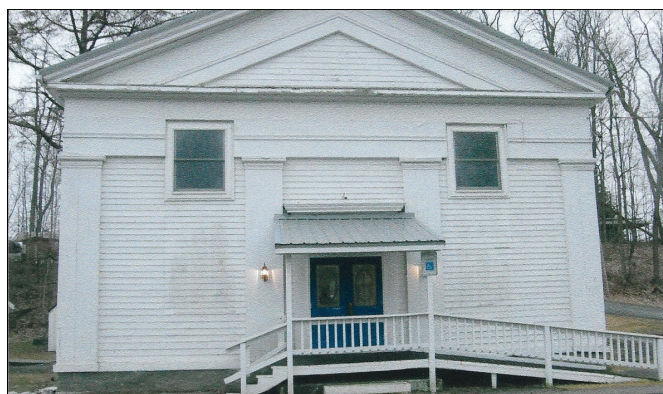
Portageville Baptist Church Changes Coming!

Pray for their V.B.S., July 9-13, for souls to be saved and for new families to be reached.