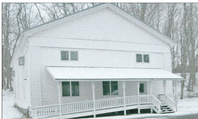
Church Youth Building