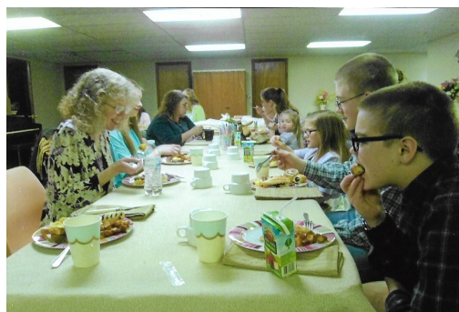
Fellowship Breakfast enjoyed! Easter Sunday Before Church