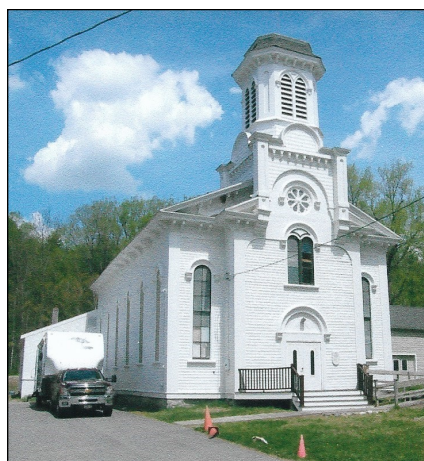
“Anywhere” in the U.S.A.