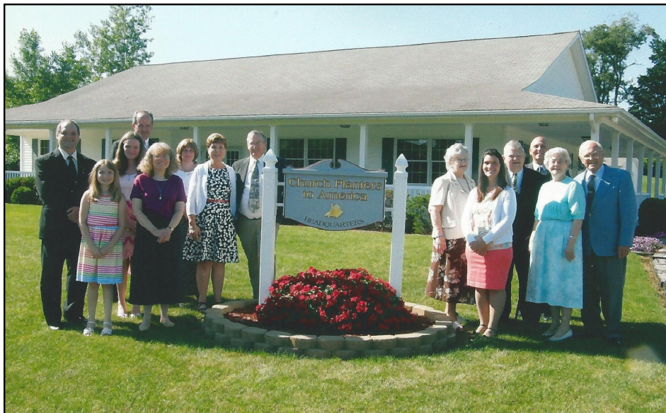
C.P.A. Mission Family

Throughout the week testimonies, good Bible preaching by our missionary pastors, special music and a variety of activities will be enjoyed by all. It is always a blessing to share ministry and family experiences. Church Planters to America is a family of people who have been called to help revitalize churches that are going through difficult times.