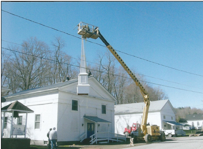
Steeple Being Installed