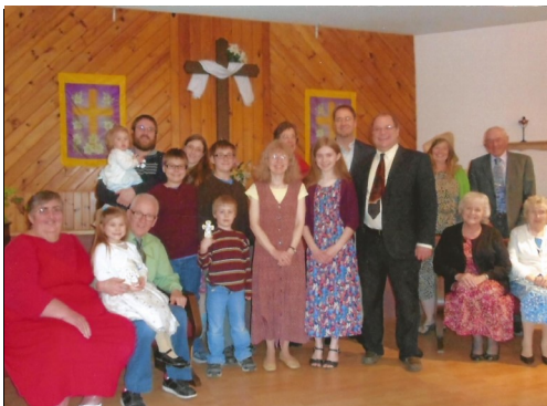
Church Family- Easter Sunday