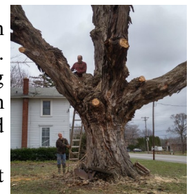
Olcott Men Cutting Fire Wood

It is estimated that the church saves about $10,000 per year in fuel costs. This money can now be used for ministry and missions. "Great job men!"