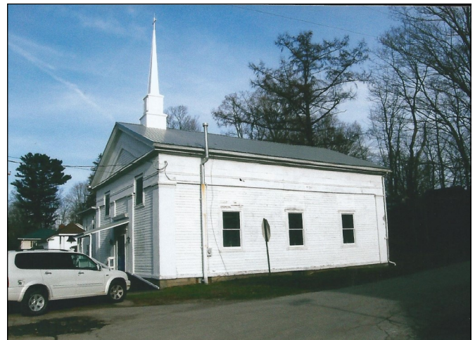
Steeple In Place