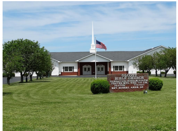
Olcott Bible Church