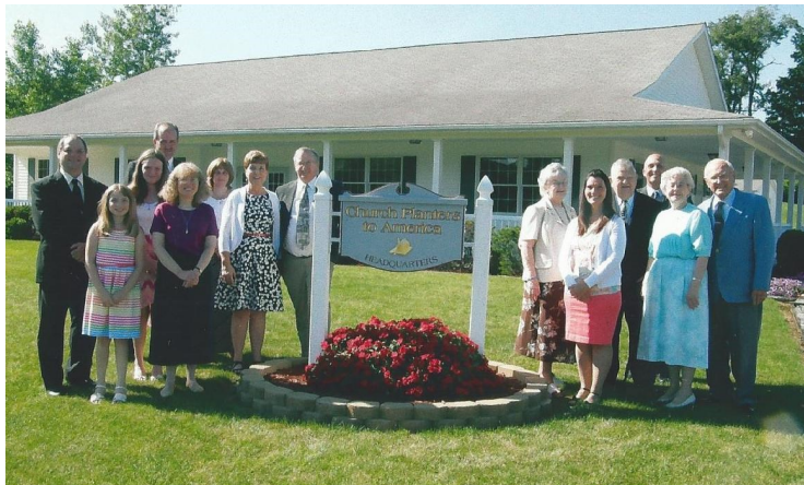
C.P.A. Mission Family

We have enclosed our "bright pink" letter asking for your help. Your gifts for this special event are an investment in each of our missionaries and the total ministry of C.P.A. We thank you for your help.