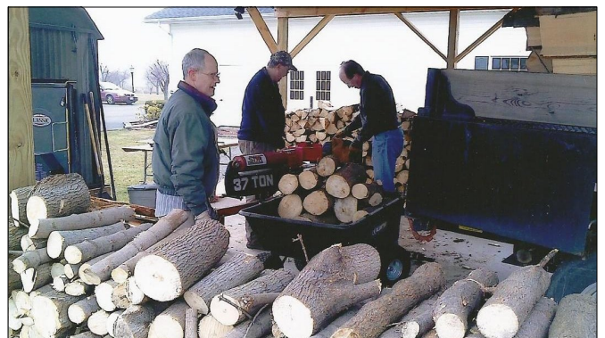
Men Split Wood at Olcott Bible Church