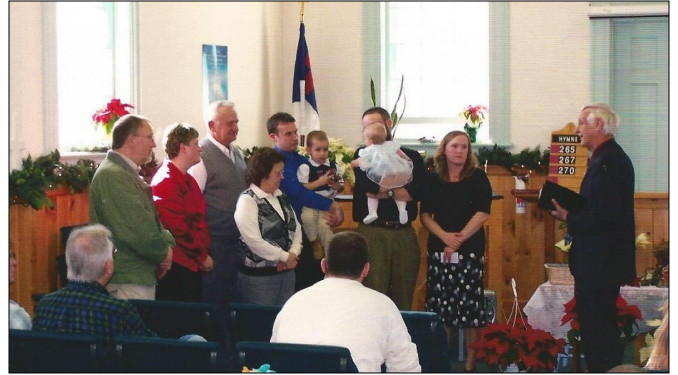
Infant Dedication at Berean Bible Church