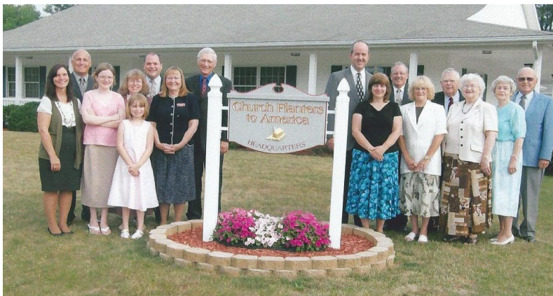
C.P.A. Missionary Family

We have enclosed our "bright pink" letter asking for your help. As you give, you are investing in each of our missionaries and their ministries. Thank you for your help.