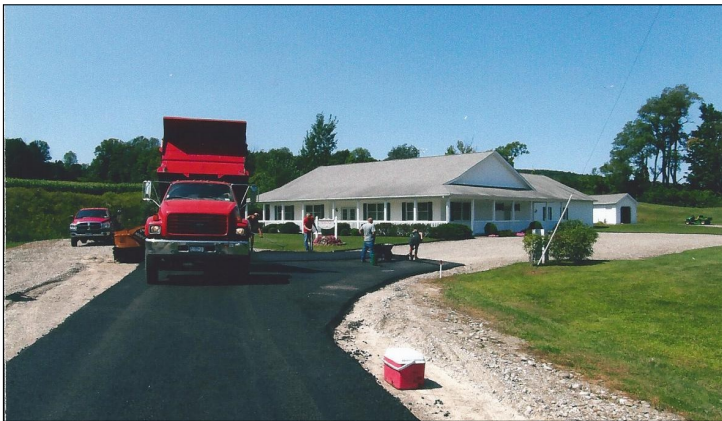
New Road to Mission Headquarters Completed

We would like to thank everyone who gave a gift for the paving of the road. We made the right decision to move forward and trusted God to meet the need. God provided in a marvelous way. We asked you to help us and many of you did. We would like to thank those of you who sent notes of encouragement with your gifts. Together, let us thank God for His goodness. If you are ever in our area, stop for a visit and see what God has done.