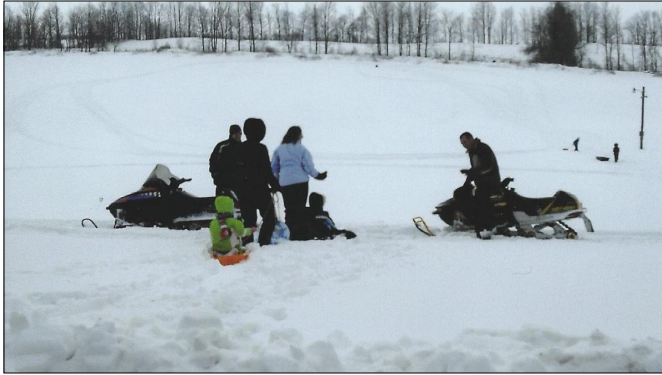
Sledding Across from Dennison Corners Community Church

Contrary to what some people think, we do not hibernate during the winter here in the North. We just plan things that, for the most part, keep us in doors as much as possible. We did have two churches, St. John, ME and Groveland Station, NY, who took large groups of both young people and adults Christmas caroling on wagons pulled by tractors. Coffee and hot chocolate followed. Below, we have some photos of activities in recent months.