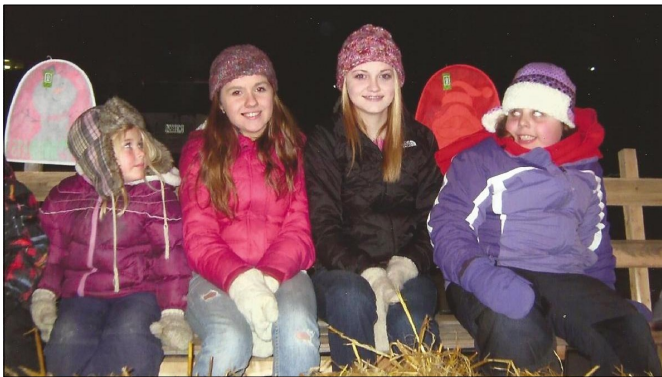
Carolers on Wagon in St. John, ME