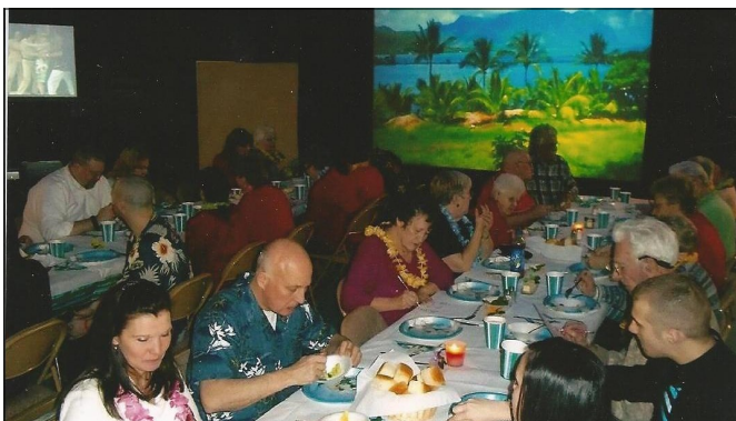
Adult Valentine Banquet, Olcott Bible Church