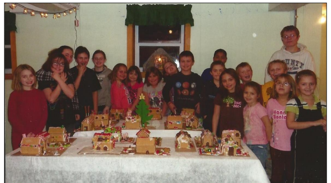
Gingerbread Creation at St. John Bible Church