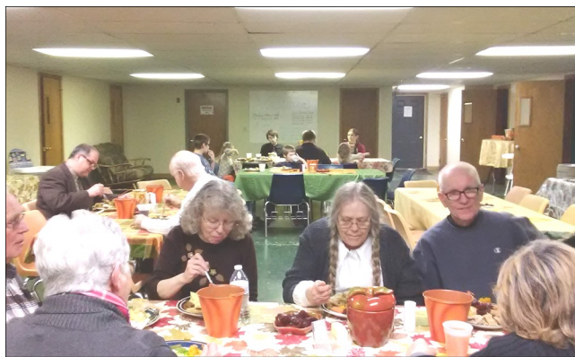
Celebrating Thanksgiving Together!

Know that we are lifting you, our supporters and supporting churches, up in prayer and are so very thankful for all your prayers for us.