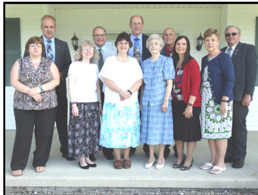
C.P.A. Mission Family

As we write this issue of the BEACON, spring is fully upon us and things are starting to change from the cold of winter. With this comes the planning for the 2020 C.P.A. Missionary Pastor's Retreat. We are looking to join together the week of July 20-24. This is always a time filled with many blessings and opportunities to fellowship and be refreshed.