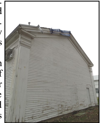
Fellowship Hall Damaged During Wind Storm

Also, in late fall we had our parking area paved. This was a need that had to be done. We had put down stones and it was very difficult to clear the yard of snow and was difficult for some to walk on the stones. We thank the Lord for His provision for this project. We have seen God's people giving consistently to the work of the ministry. Thank you for all who pray for us as we serve the local community.