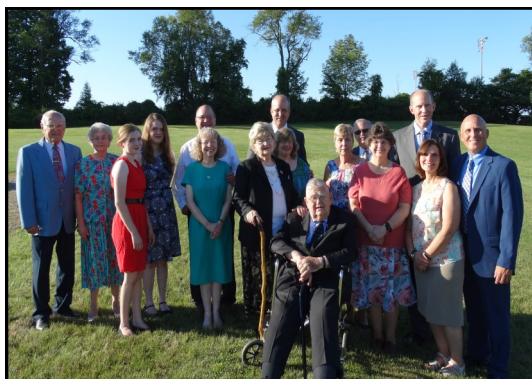
C.P.A. Mission Family

Thank you for your prayers and gifts. May God bless you in a very special way in the coming days.