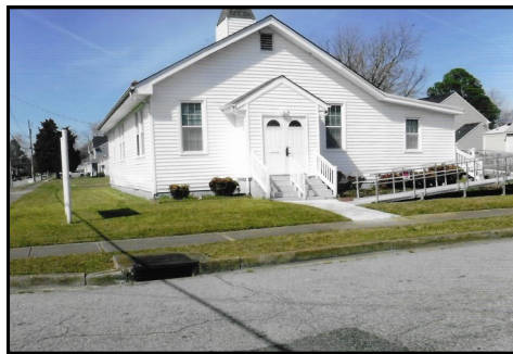
Little Creek Baptist Church