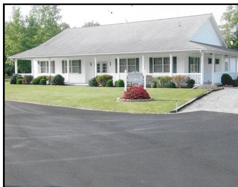
C.P.A. Headquarters Building