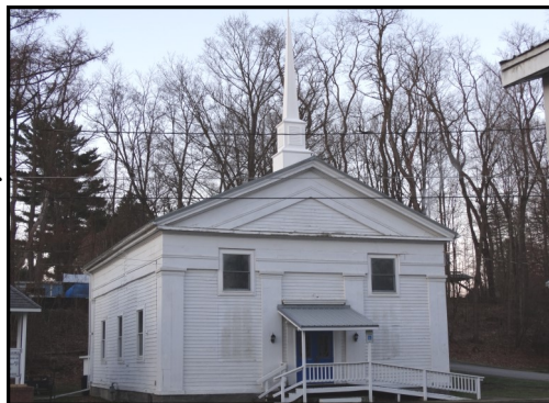
Previous Front Entrance to the Church