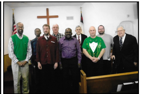
Men's S.S. Class