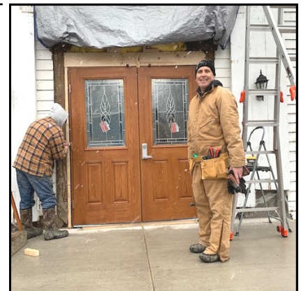
New Doors Installed