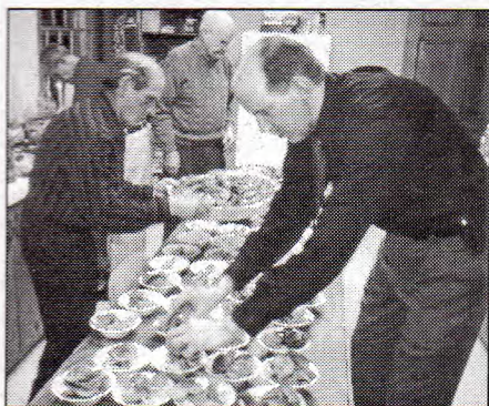
Men Prepare Special Dinner

Every February the men of the church prepare a special dinner for the ladies as they hold an Adult Valentine's Dinner. Almost 40 people enjoyed a delicious meal. The church erected a pavilion to store the wood for the wood furnace. A lot of work is involved in securing wood, the fuel savings are worth it.