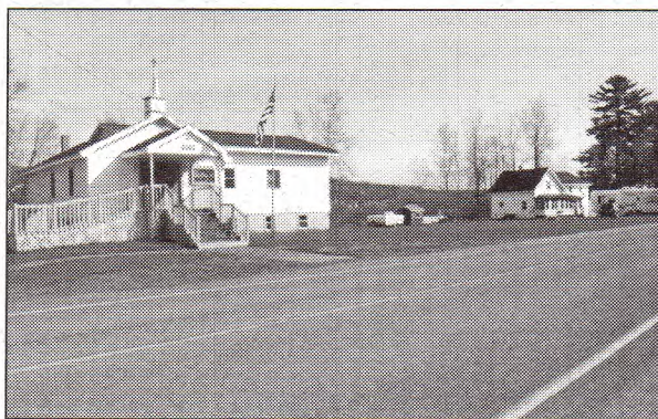
15 Years of Church Planting

During these 15 years, C.P.A. has provided missionary pastors for many churches in the Northeastern part of the United States. Hundreds of people have been saved, with lives changed for the good. We thank the Lord for His watch care over C.P.A. during these years and look to the future with great anticipation for what God is going to do in the years to come. Pray for men who have a burden for America and a vision for the local church. To all who pray and/or give to the ministry of C.P.A. we say, "Thank you".