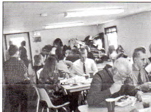
Fellowship Meal after Church