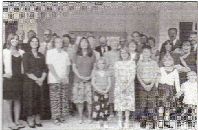
C.P.A. Missionary Family

Enclosed with this issue of the BEACON is our only financial appeal of the year. We are asking churches and individuals to help provide for the travel, food, lodging and all the other expenses for this year's retreat for our mission family. God has wonderfully supplied this need for every