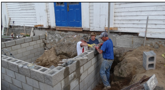
Blocks being Layed

Pray for God to provide the funds and the workers to complete this renovation project. Pray for safety for everyone who helps.