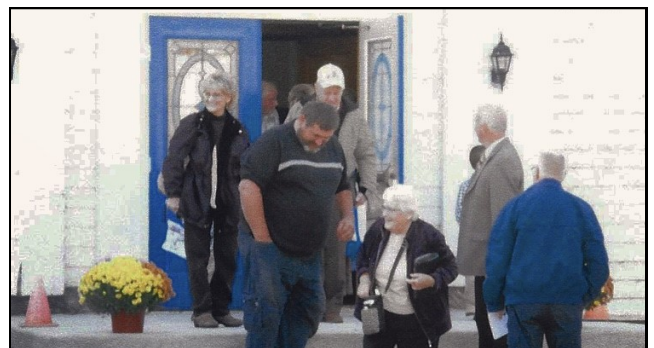
People Leaving Church Service