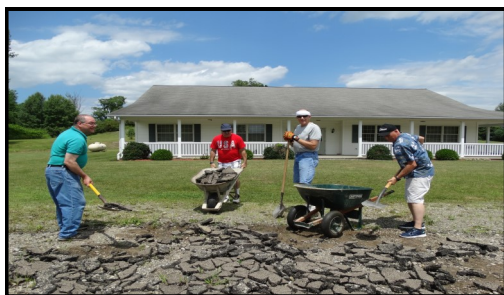
Afternoon Work Project