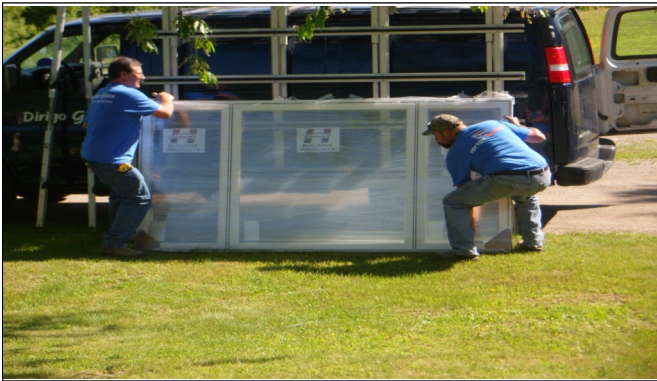
New window being installed in the parsonage!