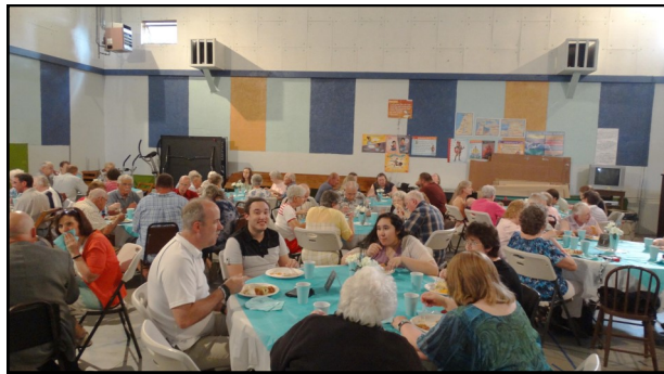
Fellowship Meal Following Steeple Dedication

Soon after installing the new steeple on the roof of the Portageville Community Baptist Church, plans were made to renovate the front of the church with a new entrance. This will include new doors, handicap ramp and the installation of vinyl siding. In front of the entrance, black top will be installed for easier walking and parking of cars.