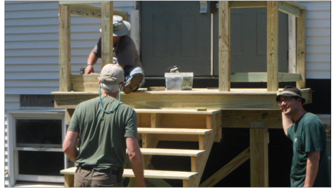
Side entrance being rebuilt at the church by volunteer help.