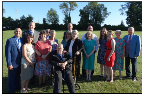
C.P.A. Mission Family

Be praying for the next year's retreat, July 15-19, 2019. Pray that more families will become part of C.P.A. and be at the retreat next year.