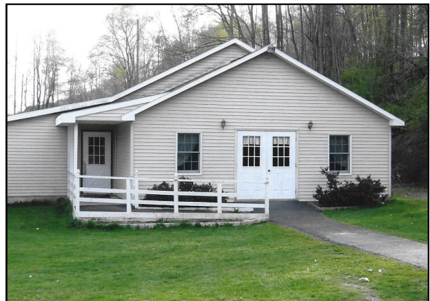
Temple Baptist Church