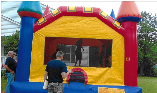
Emmanuel Baptist Church Belfast, Maine Bounce House Added to the Fun!