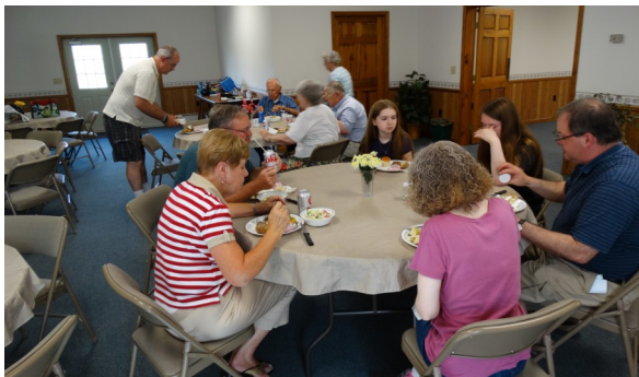
Good Food & Great Fellowship