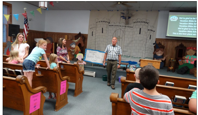
Community Baptist Church Portageville, New York Song Time at V.B.S.!

A highlight of the week was the missionary offering each night. The total given was $700. This was given in pennies which weighed 260 lbs. The money was sent to Mission Haiti Helping Kids. They minister to children in Haiti.