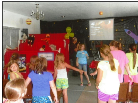
Children & Puppets During a Motion Song