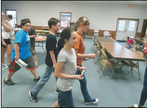
V.B.S. in Olcott