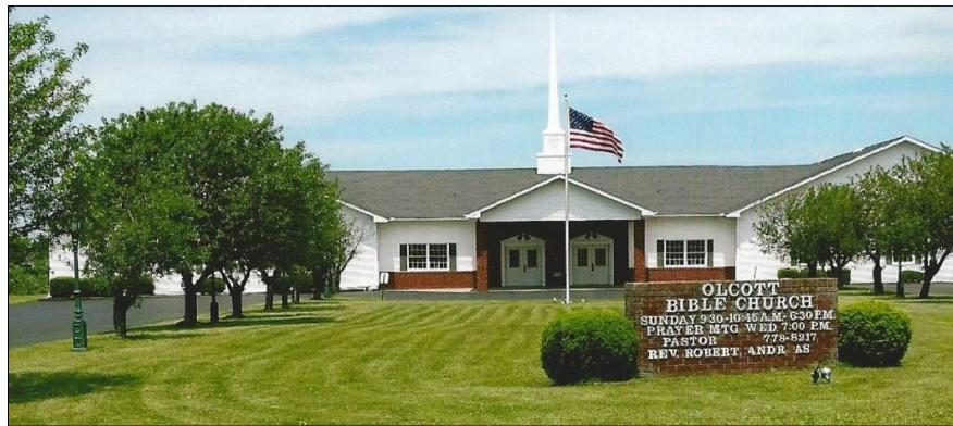
Olcott Bible Church Olcott, New York

Please pray for these situations. We are looking to God for great things in Olcott, Portageville, and Belfast.