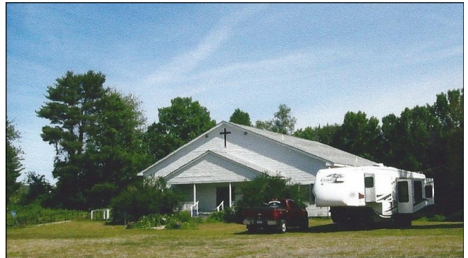
Emmanuel Baptist Church Belfast, Maine