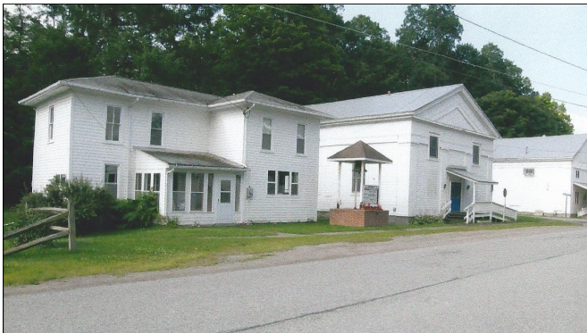
Parsonage, Church, and Youth Building Portageville Community Baptist Church Portageville, New York