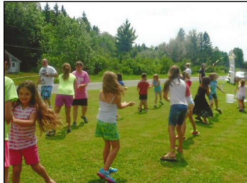
Relay Races During V.B.S.