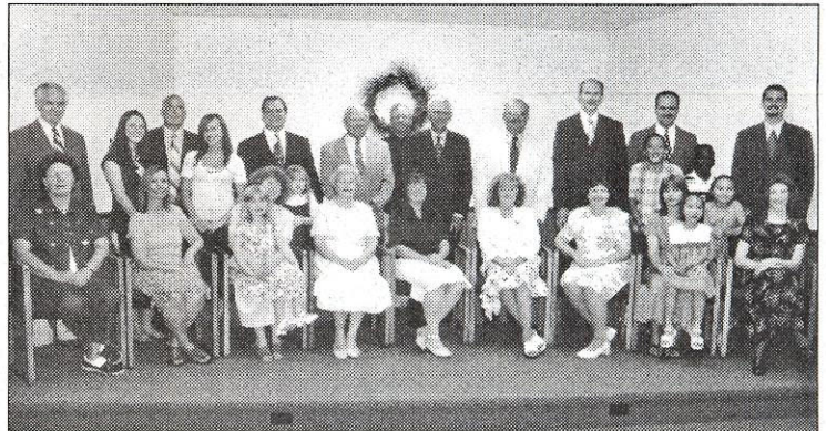
C.P.A. Mission Family

Each summer we look forward to the Annual C.P.A. Missionary Pastor's Retreat which is held the third full week of July. This year we began on Monday, July 21st and enjoyed five days of fellowship, seminars, Bible messages and great food. Even though it rained a little each day the weather did not hinder activities and our time together as a mission family. A number of the men were able to enjoy a round of golf during one afternoon.