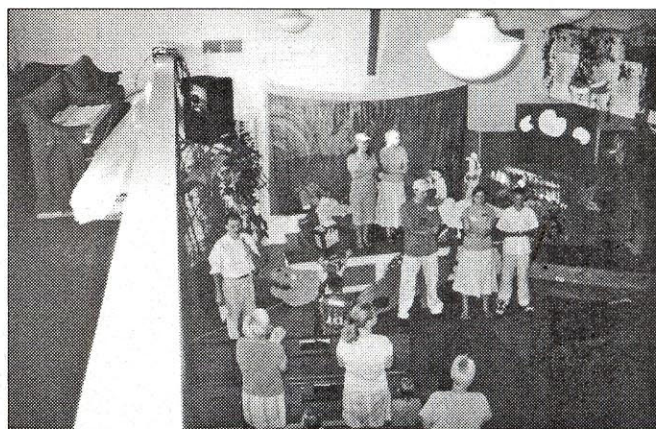
Vacation Bible School in Dennison Corners, NY