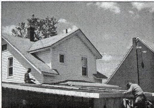
Roof Repair in Hornell

It appears that there is always something to do and extra hands make the job easier. The garage roof at the parsonage of the Hornell Bible Church had leaked for so long that everything had to be replaced.