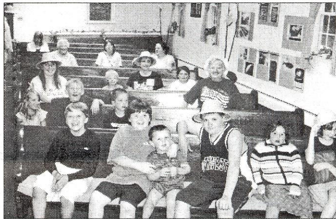
Kids Enjoying V.B.S. in Brooks, Maine