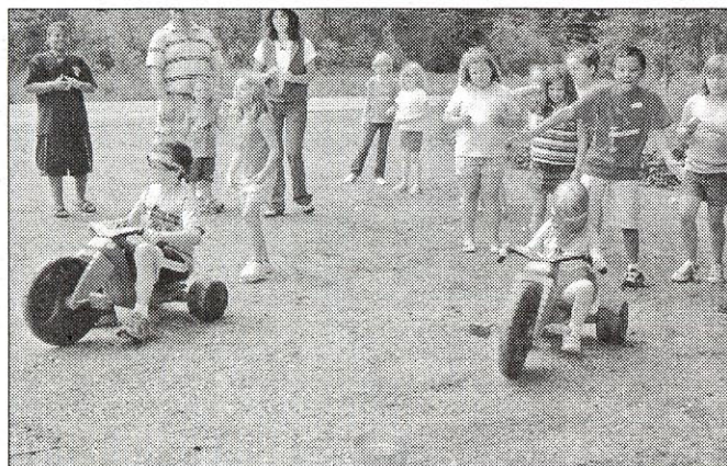
Blind Folded Relay Races at V.B.S. in St. John, ME