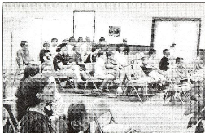
Closing Exercises at V.B.S. in Olcott, NY