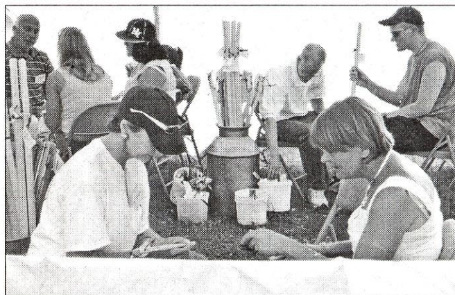
Olcott People Witness at Niagara County Fair