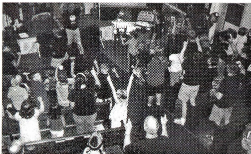
V.B.S. at Dennison Corners