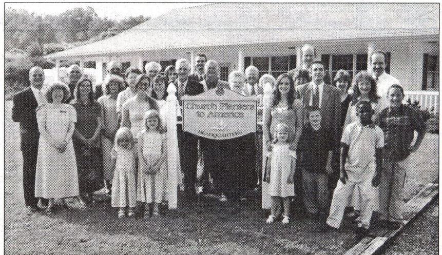
C.P.A. Missionary Family

After weeks and months of planning, the Annual C.P.A. Missionary Pastor's Retreat began on Monday, July 16th. All of our missionary families and members of the Board of Directors arrived at Missions headquarters in Almond for five days of blessing and fellowship. We were blessed with great weather and through the efforts of both the men and ladies the food was deliciously great. As usual, the fellowship was sweet and the seminars and Bible messages were a blessing.