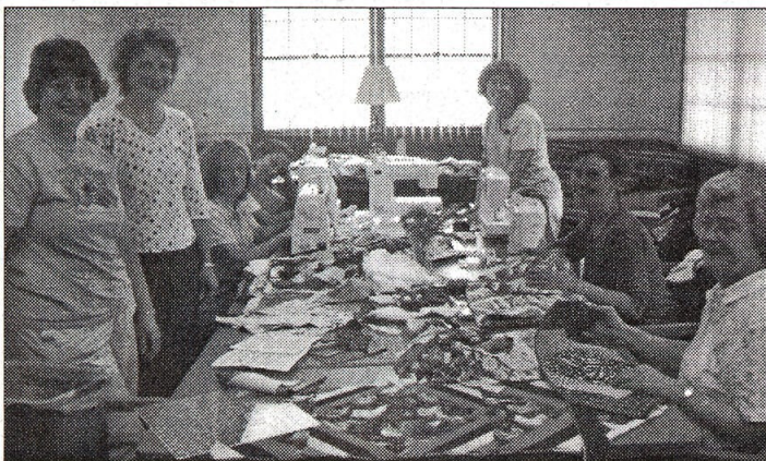
Missionary Ladies Doing Crafts