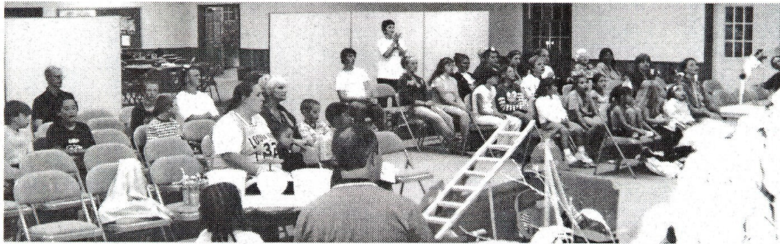
Olcott Bible Church- V.B.S.