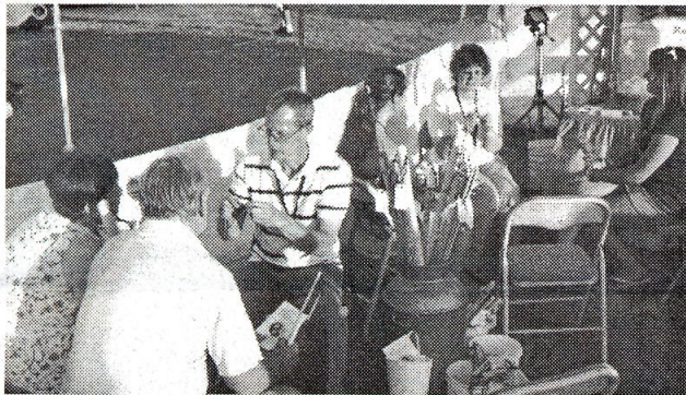
Olcott Bible Church-Witnessing at the Niagara County Fair