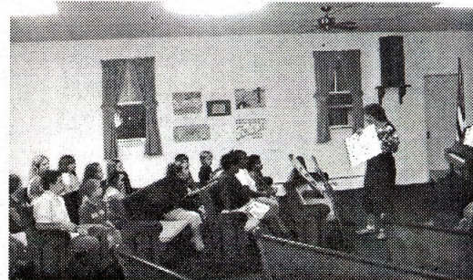
Song time at V.B.S. Brooks, Maine