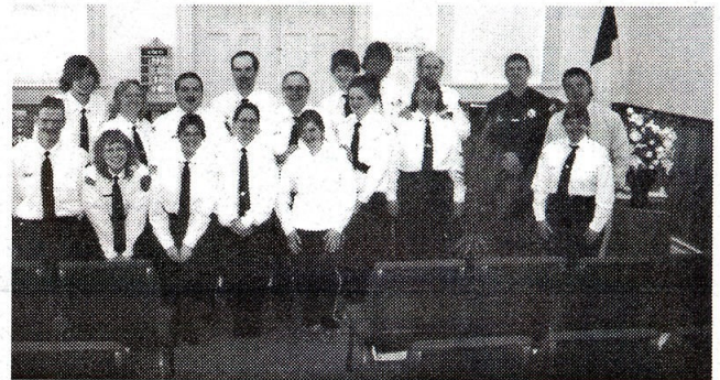
Firefighters & Police honored at Berean Bible Church, Groveland, NY