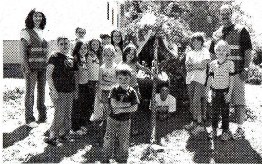
St. John, Maine Adventure in the Valley (V.B.S.)

Each summer there are many summer activities held in our mission churches with the goal of reaching young and old with the Gospel message. We thank the Lord for the opportunity to reach out to the unsaved and for all the people that participated in making these special ministries a success. Below we have pictures that depict some highlights of our summer.