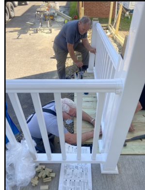
Setting the Railing