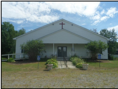
Emmanuel Baptist Church

This year has been so different than any other year we may have been a part of. Most of our lives were disrupted by the Corona Virus and now we live in a very unique, peculiar time. Many businesses and churches needed to shut down but I am glad to say that you cannot shut the church down. Many churches have learned ways to reach out with different mediums in ways they never thought they would. You see, church is vital and essential to the wellbeing of any community and culture. We often need to adapt to various circumstances in order to be