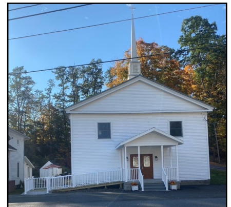
Our Building Today