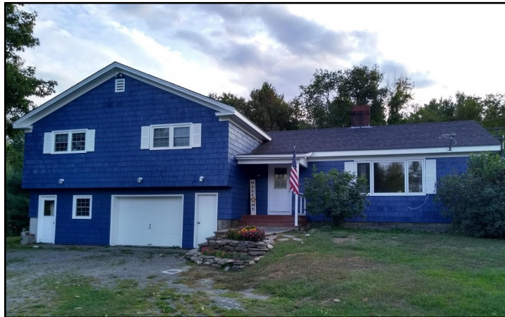
House Looks Great

Everyone will admit that 2020 has been a year like no other. One thing that comes to mind when I think of 2020 is that of change. We have all experienced so many changes in our lives and communities that I do not need to mention them here. But what I do want to mention is the very positive changes that we have seen in the life of Emmanuel Baptist Church.