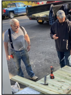
Building the Ramp

In the meantime we have some things that need to be fulfilled by code before our certificate runs out. We were able to build a handicap ramp and fix the door sill. We are thankful for the men that have an association with the church, who worked diligently on the ramp. Grace Mission to The World were willing to help us with expenses for this endeavor. We are so thankful for how God provides. Below are pictures of this work.