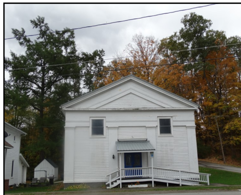
The Church Building Five Years Ago When We Arrived