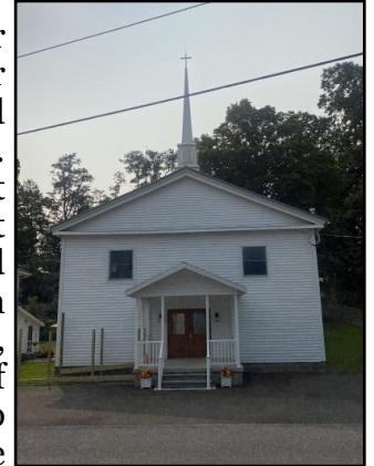
Portageville Community Baptist

effective in ministering the Gospel of Jesus Christ. Jesus said, "... Upon this rock I will build my church; and the gates of hell shall not prevail against it." Matthew 16:18b. The Rock is a Person and a statement made about this Person, Jesus Christ. This is the Rock, "Thou art the Christ, the Son of the living God." The church will always remain a force to be reckoned with until Jesus returns for us.