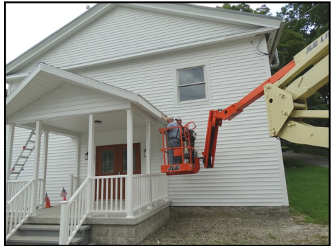
Finishing the Siding on Front

order to be pro-active, we also removed a very large tree from behind the parsonage before any damage could be done. Lastly, Vacation Bible School was a great success. There was excitement and enthusiasm as we ministered to the children God gave us. We appreciate all your prayers for the church and all that is going on at this time.