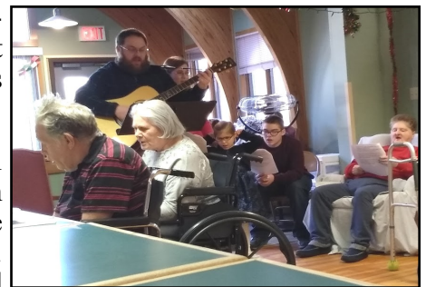
Music is Always a Blessing!