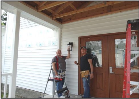
New Lighting and Doors

The summer has been extremely busy with work continuing on the church building. Although there are few workers, we are pleased with the project thus far. The front of the church has been completely sided and the entrance and platform, which includes roof, are finished. New doors have been installed and lights have been hooked up. In the front we still need to build a handicap ramp and then prepare the other three sides for siding. Another part of the project that we would like to see done this year before the weather turns is to pave the parking area in front of the house and church. We have asked for an estimate and are presently waiting for this. This is time sensitive but we were told it can be done up until November. Also this summer, we had a tree fall upon our fellowship hall causing $15,000 worth of damage. In