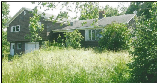
Parsonage Before Work Began

Pray for people to be saved, for the church to grow, for the Ruggerios financial support to increase to a livable level and for God to be blessed. It is located just across from Hannaford grocery store, just off Route 1.