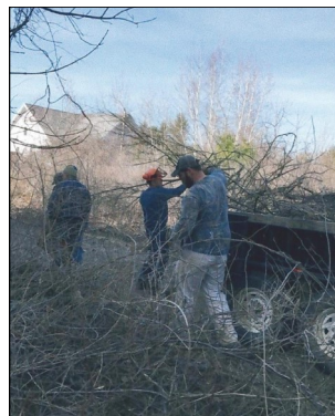
Men Cleaning Property