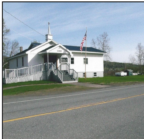
St. John Bible Church