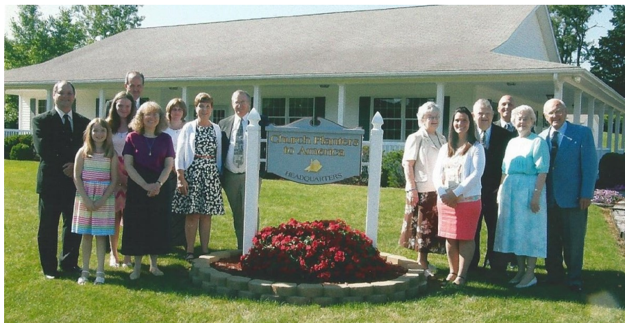
C.P.A. Mission Family

We have enclosed our "bright pink" response form. Giving is behind other years, most likely due to your generosity to the BELFAST PROJECT. Please pray for God to challenge people to support this important time for our mission family. We thank you for your help.