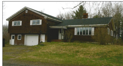
Parsonage After Cleaned Up