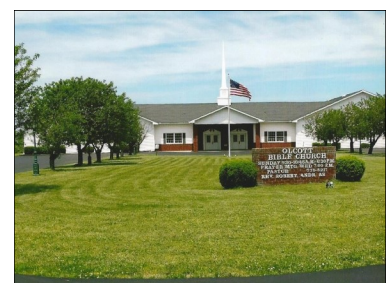
Olcott Bible Church