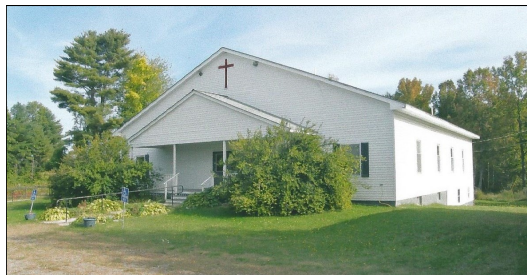
Emmanuel Baptist Church