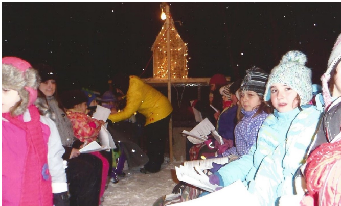
Christmas Caroling through St. John & St. Francis in Northern Maine, Riding on a Trailer St. John Bible Church