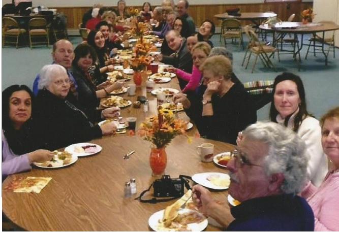
Great Harvest Dinner Olcott Bible Church

The harsh winter weather did not hinder the mission churches from having a variety of activities that warmed the hearts of everyone and provided many opportunities to share the gospel with friends and neighbors. Through pictures, we share some special moments.