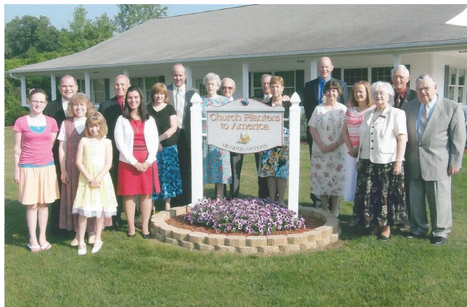
C.P.A. Missionary Family

In order to make it all possible, we need many individuals and churches to pray for God's blessing on this special time. We, also, need people who will give a special gift for the expenses of the retreat and for the travel of everyone. With the rising cost of everything, we are trusting God to provide