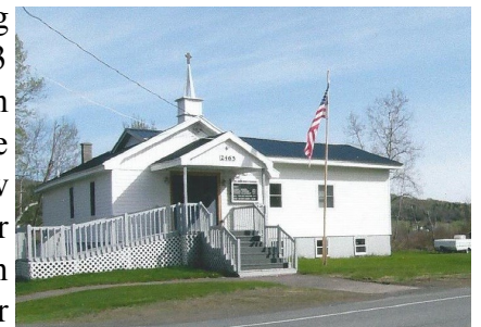
St. John Bible Church