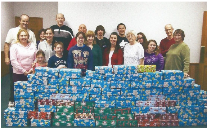
Boxes All Filled for Operation Christmas Child Olcott Bible Church