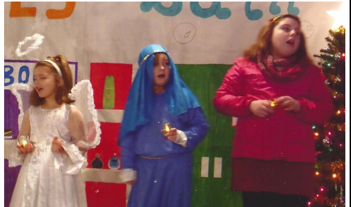
Young People Participate in the Christmas Program St. John Bible Church