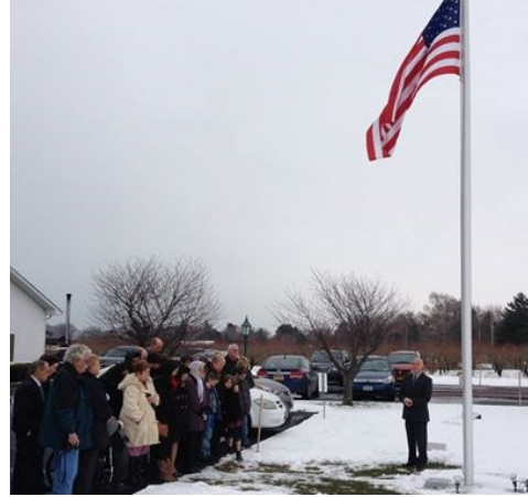
Dedication of Flag and Pole Olcott Bible Church