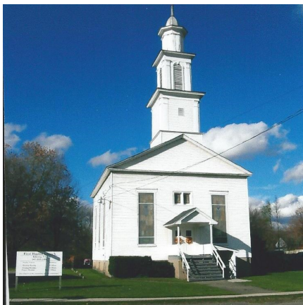
First Baptist Church