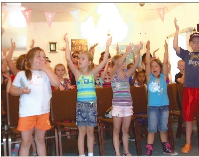
Motion Song at Vacation Bible School