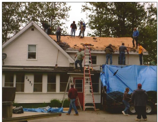
Volunteers re-roof the church parsonage