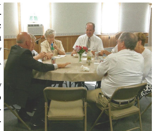
Serious Discussion Going On!

A special thanks to the many individuals and churches who sent