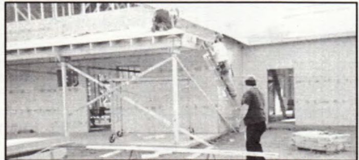
Roof Sheeting Completed - May 29