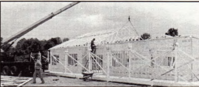
Trusses Put in Place - May 22