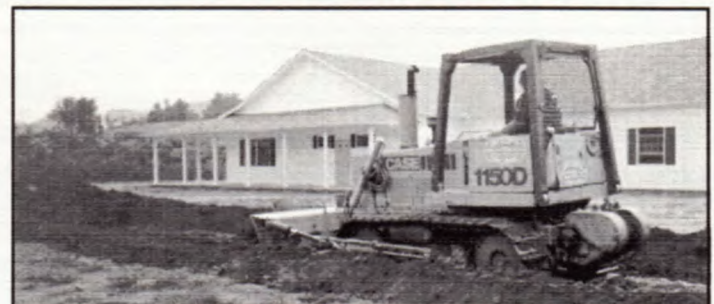
Final Grading - September 15