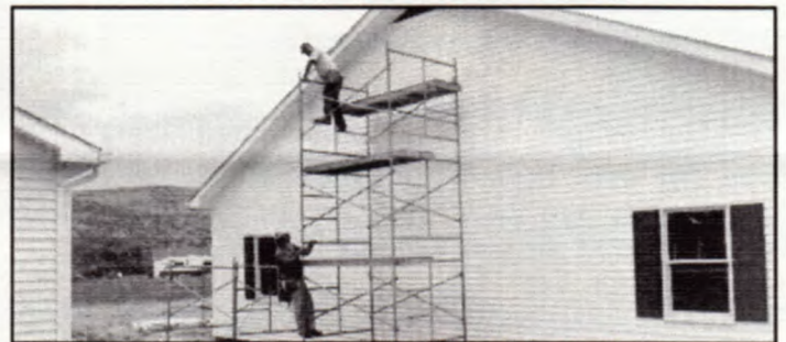
Siding Completed - August 5