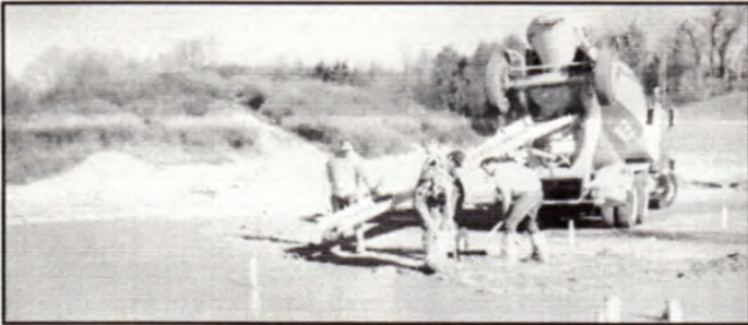
Cement Floor is Poured - April 28