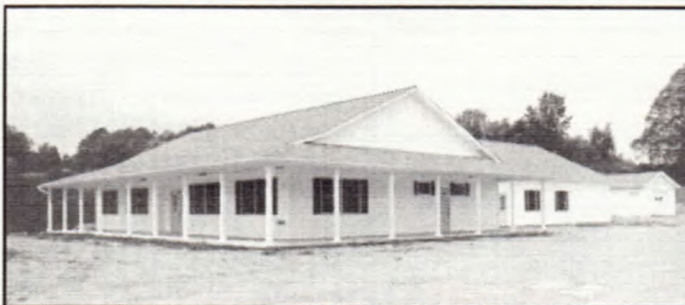
Exterior Completed - August 13