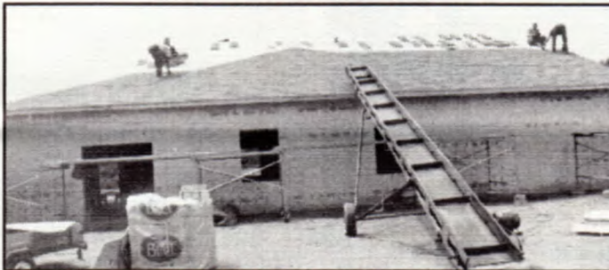
Roof Shingled - June 1-4