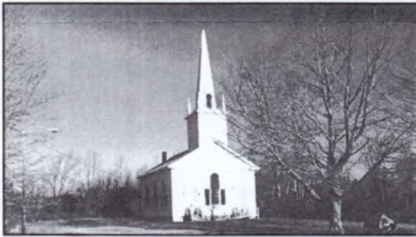
Hope Community Bible Church