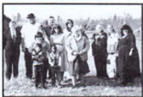
Future Building Site