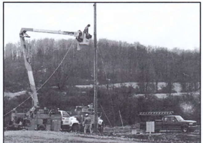
Electric Service Being Installed